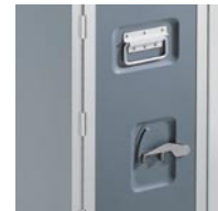
Embossed locking dish