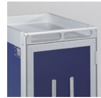
Deleted dry ice drawer