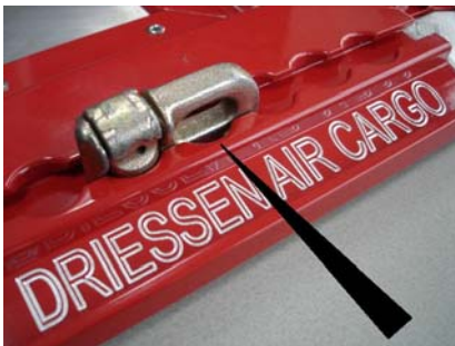
Dimensioned positions indicate eye of double stud.